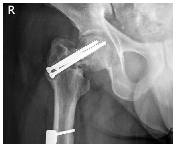
Fig. 1 Improper screws nearly protruding to the hip joint.

of the femoral head and delayed union of the femoral shaft (Figure 1). Because of the bone necrosis at the femoral head, the patient smoked heavily. Therefore, the surgeons considered it most appropriate to perform total hip arthroplasty (THA) surgery, which was the option of surgery rather than refixation or valgus osteotomy. Additionally, THA in this patient had another advantage. The bone graft obtained from the femoral head could be inserted into the femoral shaft fracture, which delays union. However, in this patient, if using conventional THA, there was a chance that the femoral stem would collide or affect the screw fixation at the shaft of the femur, which was still delayed union, and the screws could not be removed. Therefore, it was necessary to choose short stem THA even though the neck length could not be set to 5 mm, and the quality of the lateral cortex of the proximal femur was poor owing to a bone defect from multiple screws fixation.