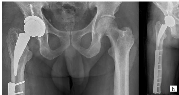
Fig. 3 The film five years after short stem THA.

THA, especially the lateral cortex of the proximal femur, which had been eroded by the multiple screws, was healed with bone ingrowth. Although the film X-ray of both hip AP showed stable fibrous ingrowth at the lateral side of the stem; however, the medial side of the stem showed stable fixation by bone ingrowth. There was no sign of loosening, no limb length discrepancy, no subsidence, or migration of short stem THA (Figure 3). The patient had no clinical hip pain, was able to walk normally, and was very satisfied with the result of treatment, and the Harris hip score was 93.