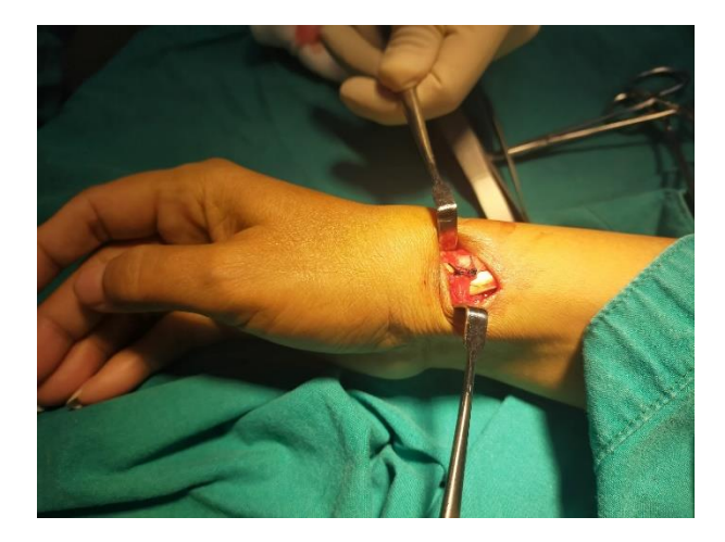
Fig. 3 The distal and proximal bases were sutured together without tension.

Fig. 2 The 1<sup>st</sup> extensor retinaculum is cut in a step cut, with the ends defined as the distal ulnar and proximal radial bases.