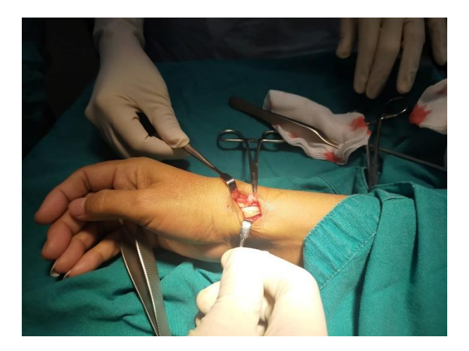
Fig. 2 The 1<sup>st</sup> extensor retinaculum is cut in a step cut, with the ends defined as the distal ulnar and proximal radial bases.