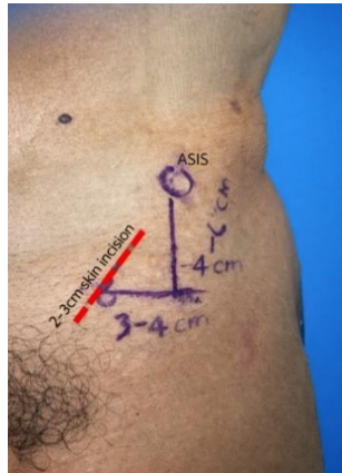
Fig. 2 A 2–3 cm oblique skin incision approximately 4–6 cm distal and 3–4 cm medial to the anterior superior iliac spine (ASIS).

placement, the specimens were dissected using an iliofemoral approach. The iliac bone and hip joint were exposed to allow direct visualization of the pin position. Pin malposition and injuries to adjacent structures were recorded.