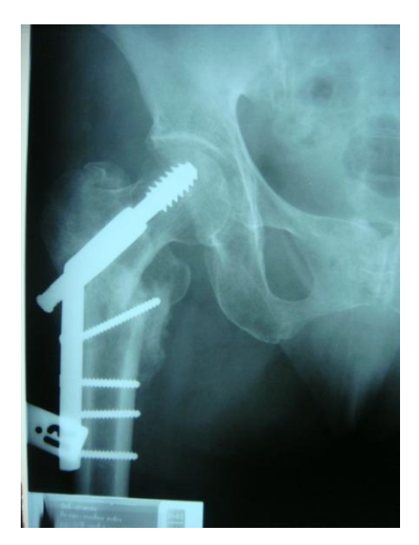
Fig. 2 Radiograph at 6 months after treatment showing a collapse and break of the lateral cortex

For intact lateral cortex fractures in the SHS group, one patient with wound infection required antibiotics and debridement and one patient required reoperation due to failure of the implant. In 45 broken lateral cortex fractures, one patient in the PFNA group had a superficial wound infection without reoperation, and two patients in the SHS group required reoperative surgery both due to a collapse and cut through (Fig. 2). The postoperative radiographs of a 70-year-old women with an AO/OTA 31-A2 -type trochanteric fracture which demonstrated that the instrument failure (Fig. 3)